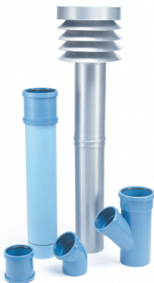
Piping and air inlet.

For a typical domestic application, a single 40m loop of pipe around the house is normally sufficient for the demands. If a loop layout is not possible, a meander layout can be used. The pipes are laid a metre apart in the existing soil and require a gradient of 2° to the condensation discharge, which can build up when the air is cooled in the summer. This is discharged using a submersible pump or plumbed into a waste system.